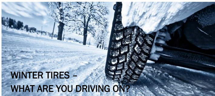
WINTER TIRES – WHAT ARE YOU DRIVING ON?