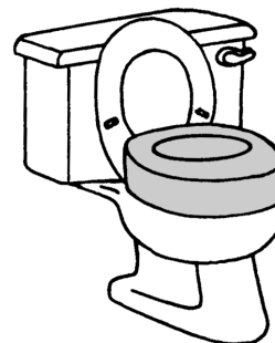
Raised (elevated) toilet seat

If the mobile person is missing the toilet, get a toilet seat in a color that is different from the floor color. This may help him see the toilet better. If the person with AD fails to remember to wipe himself or wash his hands, you will have to prompt him to do it, help him to do it, or do it for him.